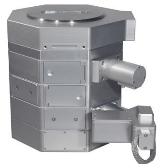
Two-Photon iMIC Digital Microscope